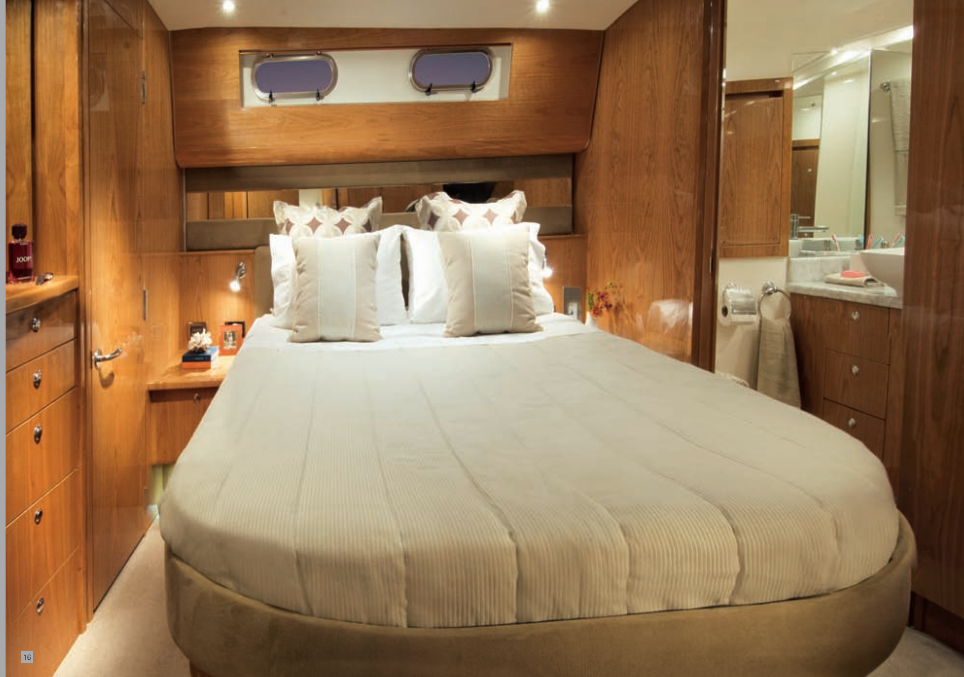
16. Generous master stateroom with queen double bed. 17,18. A vast vanity mirror in the master stateroom with ample hanging space beside and beneath. 19. The master ensuite features a marble benchtop and chic porcelain bowl. 20. The bed in the master stateroom hinges up to reveal a large storage space. 21. The forward starboard cabin has comfortable bunks with storage under. 22,23. Forward stateroom has a walk-around queen double bed that hinges up for additional storage. 24. The aft starboard cabin includes the washer and dryer as well as a single bunk. 25. Guest bathroom with Vacuflush toilet and separate shower stall.

At the end of the day, sleeping easy comes with having confidence in your boat and the satisfaction of having made the wisest choice. That thousands of Riviera owners upgrade to another Riviera suggests that this fabulous new model will give you the soundest of sleeps.